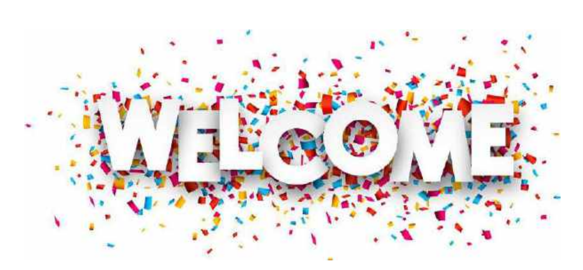
Welcome to the Adamson & Cleveland, LLC Summer Newsletter. We are excited to introduce you to our 1st Quarterly Newsletter ! We have created this with articles and features we think will be of interest to you. Please take a moment to check it out and let us know what you think. We welcome your comments and feedback.